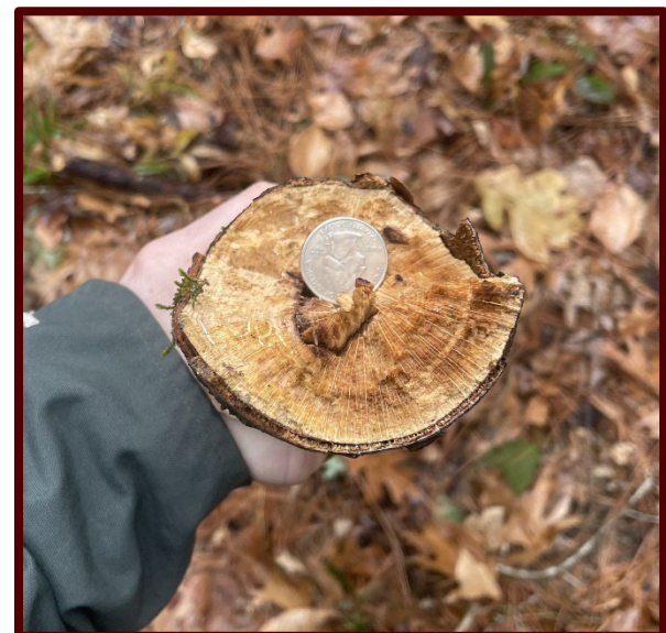
Quarter placed on the end of the limb that struck FAL3(t) to show size/scale

As they made their way down the trail, one of the qualified FAL3's started making phone calls to notify supervisors of the incident. They continued talking with the trainee and asking him questions as they helped him along the walking trail to ensure he remained coherent and conscious. When they made it to the trucks, they put the trainee in the passenger seat of the local FAL3's truck. The other FAL3 retrieved some gauze from a first aid kit in his truck, and he gave it to the trainee to try to stop the profuse bleeding from his nose. The gauze was not enough for the amount of blood that was flowing, so he was given a yellow Nomex shirt to hold onto his face as they drove the few miles to the hospital in town. The entire process from assessment to transport happened very quickly. They arrived at the hospital seven minutes from the time of the injury, and the injured sawyer was immediately taken back in the emergency room for treatment.