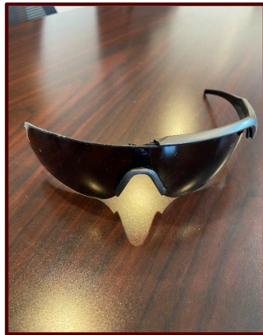
Damaged safety glasses worn by FAL3 Trainee