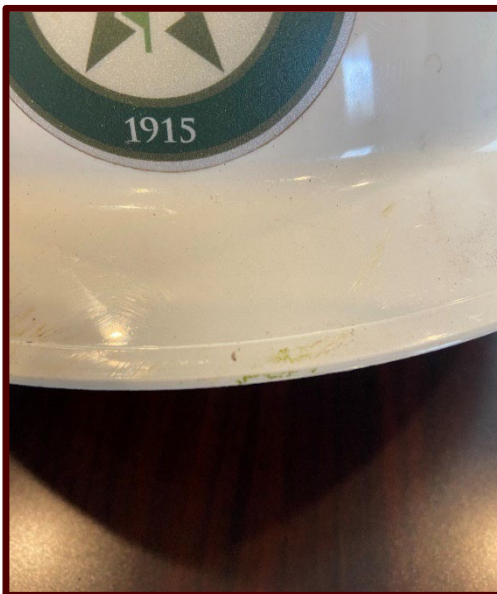
Smudge where limb impacted FAL3 Trainee's hard hat and knocked it off his head